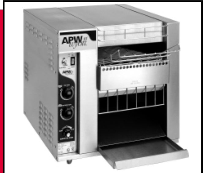
MODEL BT-15-2 CONVEYOR TOASTER